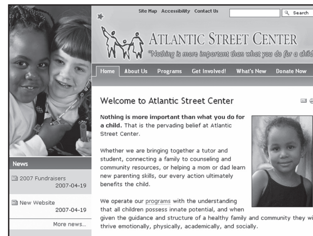
The new Atlantic Street Center homepage

We'd love to hear what you think of our new website! Visit us online at www.atlanticstreet.org and then drop us an email at ascinfo@atlanticstreet.org .